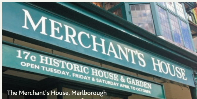
The Merchant's House, Marlborough